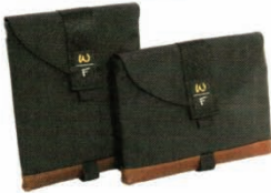
Best Style: iPad Exo SleeveCase $49-$99, sfbags.com

A bag is for iPad owners who want to carry accessories and other personal items with their iPad. Bags come in many styles, colors, sizes, and prices. Here are my choices for the Best Bag category: