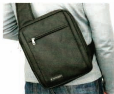
Best Value: Kensington Sling Bag $19.99, us.kensington.com

"I love my new Booq bag.... It's very heavily padded and no doubt would save your iPad in a drop." The Shadow XS has room for papers, business cards, keys, and iPad accessories while maintaining a minimum exterior size. It's also airport friendly. It's a relatively expensive solution, but according to Painter, "... it's worth the premium."